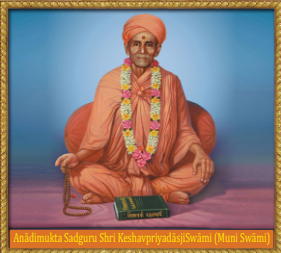
Anādimukta Sadguru Shri Keśhāpradāsjī Swami (Muni Swami)