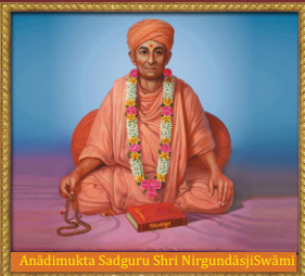
Anādimukta Sadguru Shri Nigundāsjī Swami