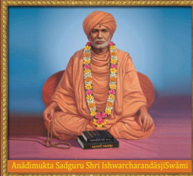
Anādimukta Sadguru Shri Ishwarārandāsjī Swami