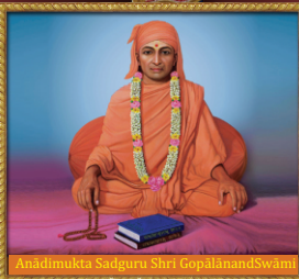
Anādimukta Sadguru Shri Gopalanandji Swami